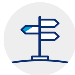
specialized support for tobacco cessation