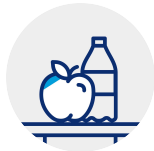
specialized support for weight loss