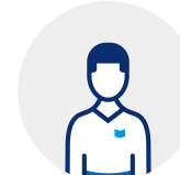
personalized health information