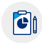
voluntary health questionnaire

Use Healthy You with WebMD to understand your health risks and take steps that can help maintain or improve overall wellness. Set goals, work with a coach, and use a variety of online tools that are personalized to you.