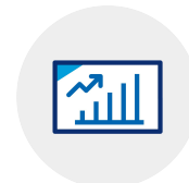
online goal setting tools